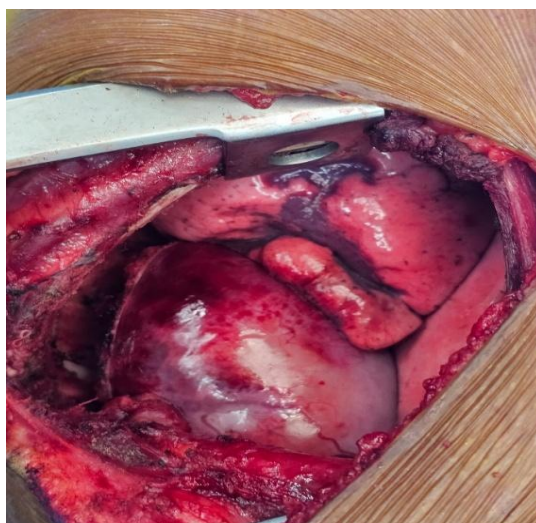
Fig (2): Intraoperative photograph of the intrathoracic mass