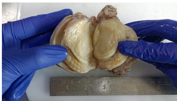
Fig (3): Macroscopic picture of the tumor